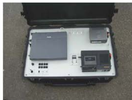
Portable Command Case

When the occasion arises that it is impossible to use the Command Van, TSE manufacture a Portable Command Case that duplicates the control functions of the Command Van, it can also record all the incoming video, cellular video, audio transmissions, main control is by a laptop computer.