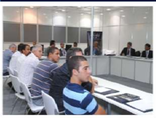
Meeting of National Council of Municipal Secretaries & Managers of Public Security from the State of Rio de Janeiro