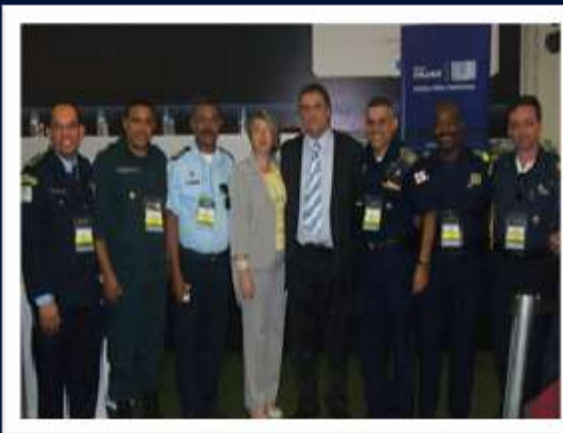
1 st Meeting of the Executive Committee of the National Council of Municipal Guards