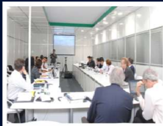
16 th Board Meeting of the National Council of Heads of Forensic Science Service Organisations