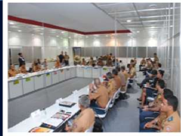
1 st Ordinary Meeting in 2012 of the National League of the Military Firefighters from Brazil