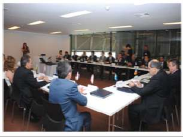
36 th Ordinary Meeting of the National Council of Heads of Civilian Police Forces