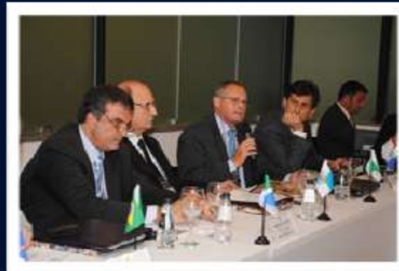
43rd Ordinary Meeting of the National College of State Secretaries of Public Security